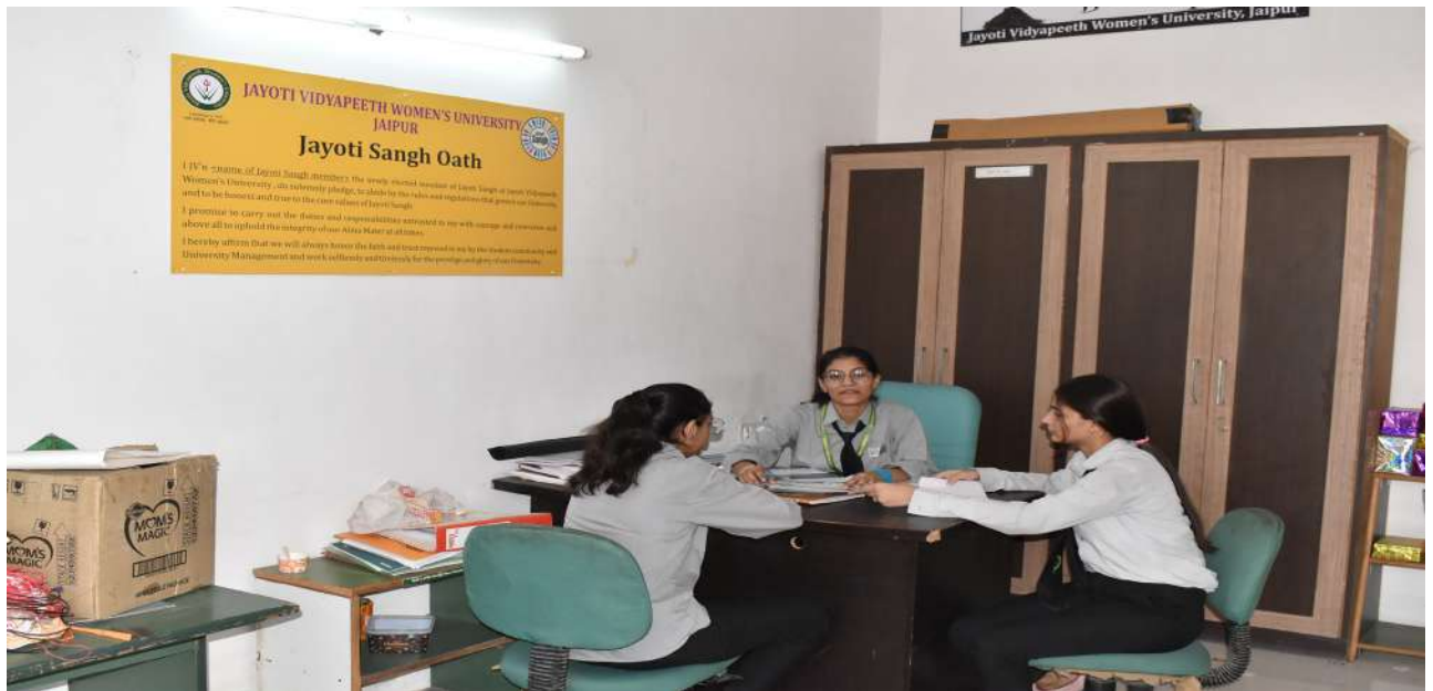
Student Council Office