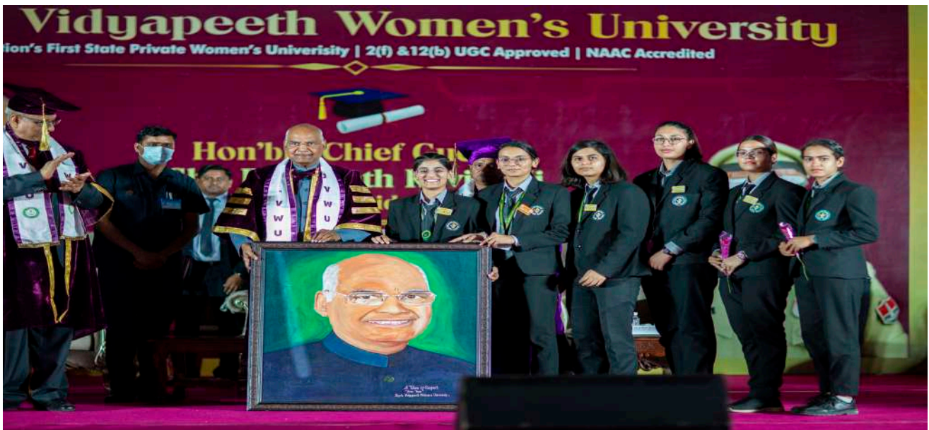
Student Council Members with Hon'ble Former President of India