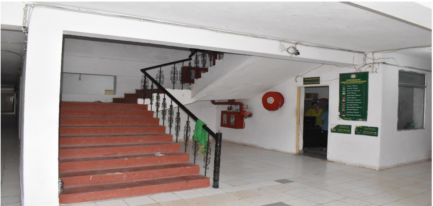
Counselling Centre & Rest Room