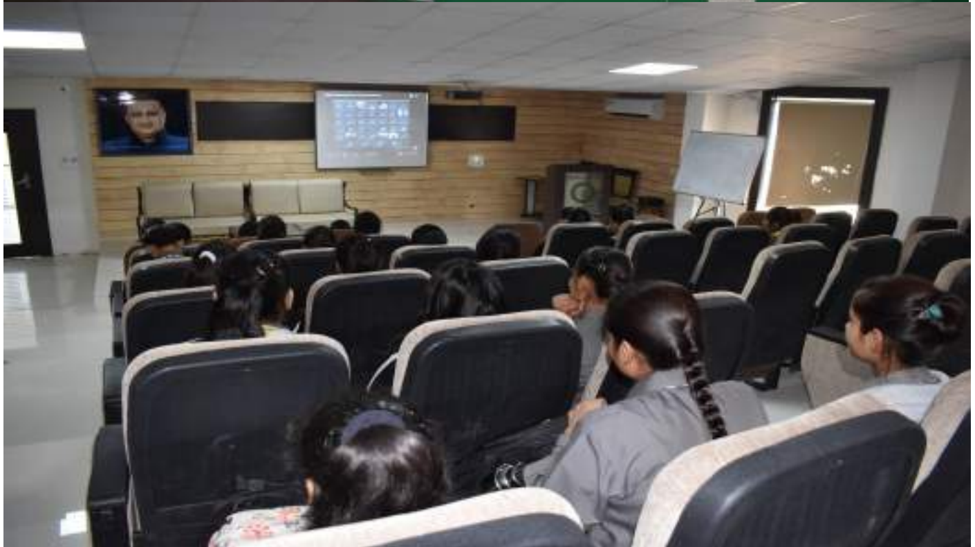
Faculty Development Programme (FDP)