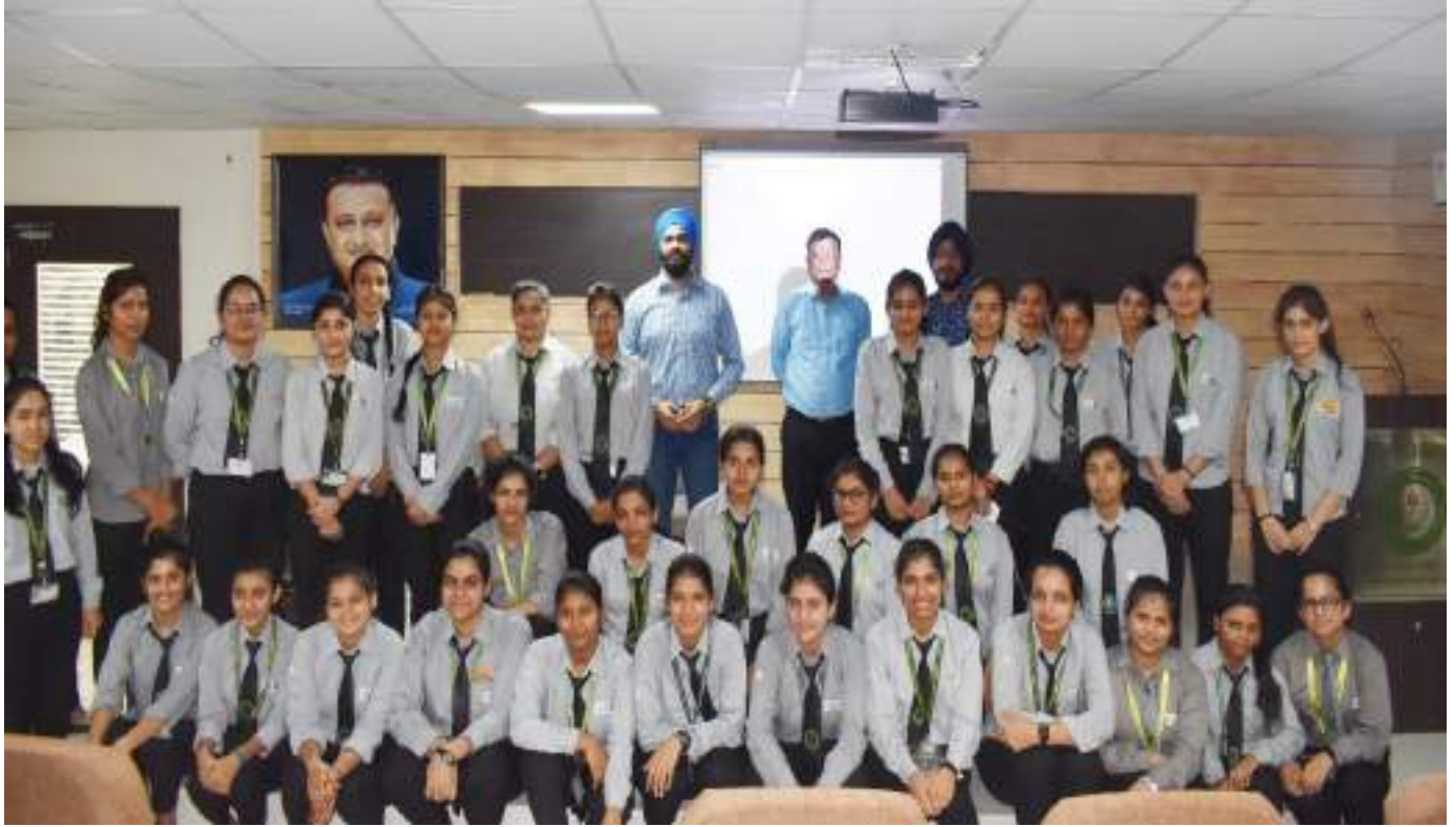
Workshop on Artificial Intelligence & Machine Learning in collaboration with Hexnbit

NAAC Accredited | UGC Approved | Recognized by Statutory Councils