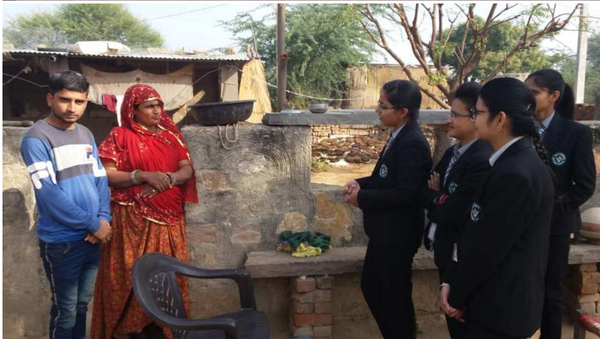
Door to Door Survey