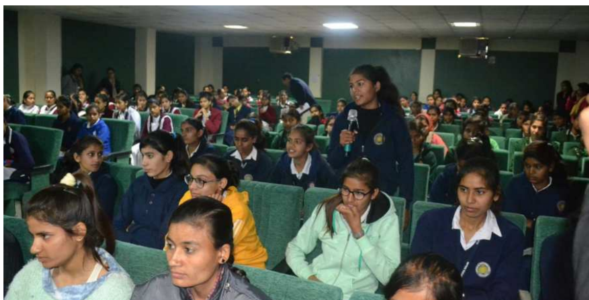
Career Counselling Session for School Girls of nearby Villages