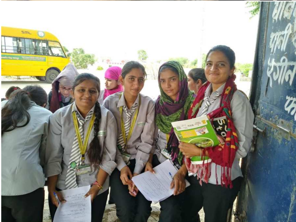
Door to Door Baseline Survey