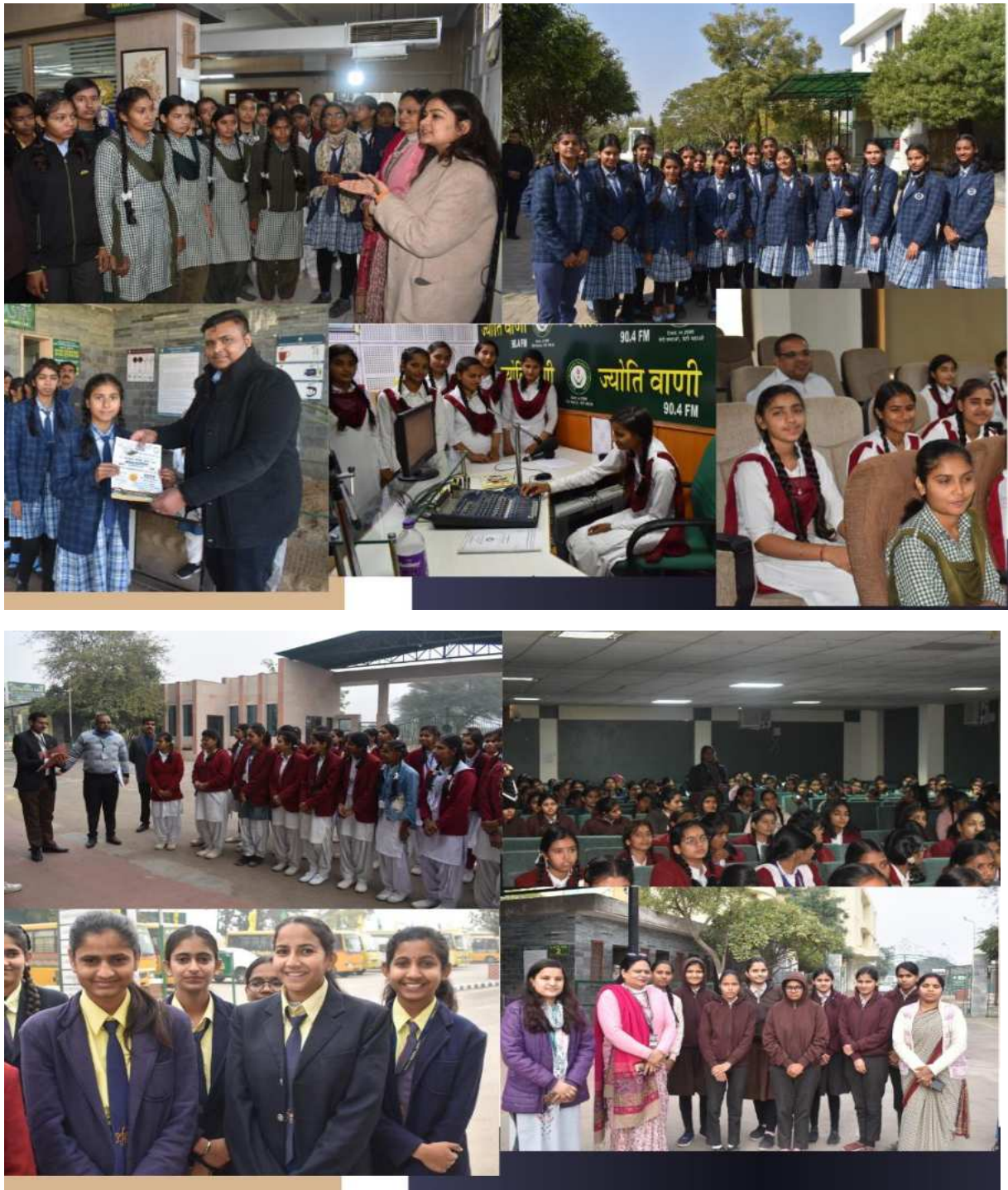
Career Counselling Session for School Girls of nearby Villages