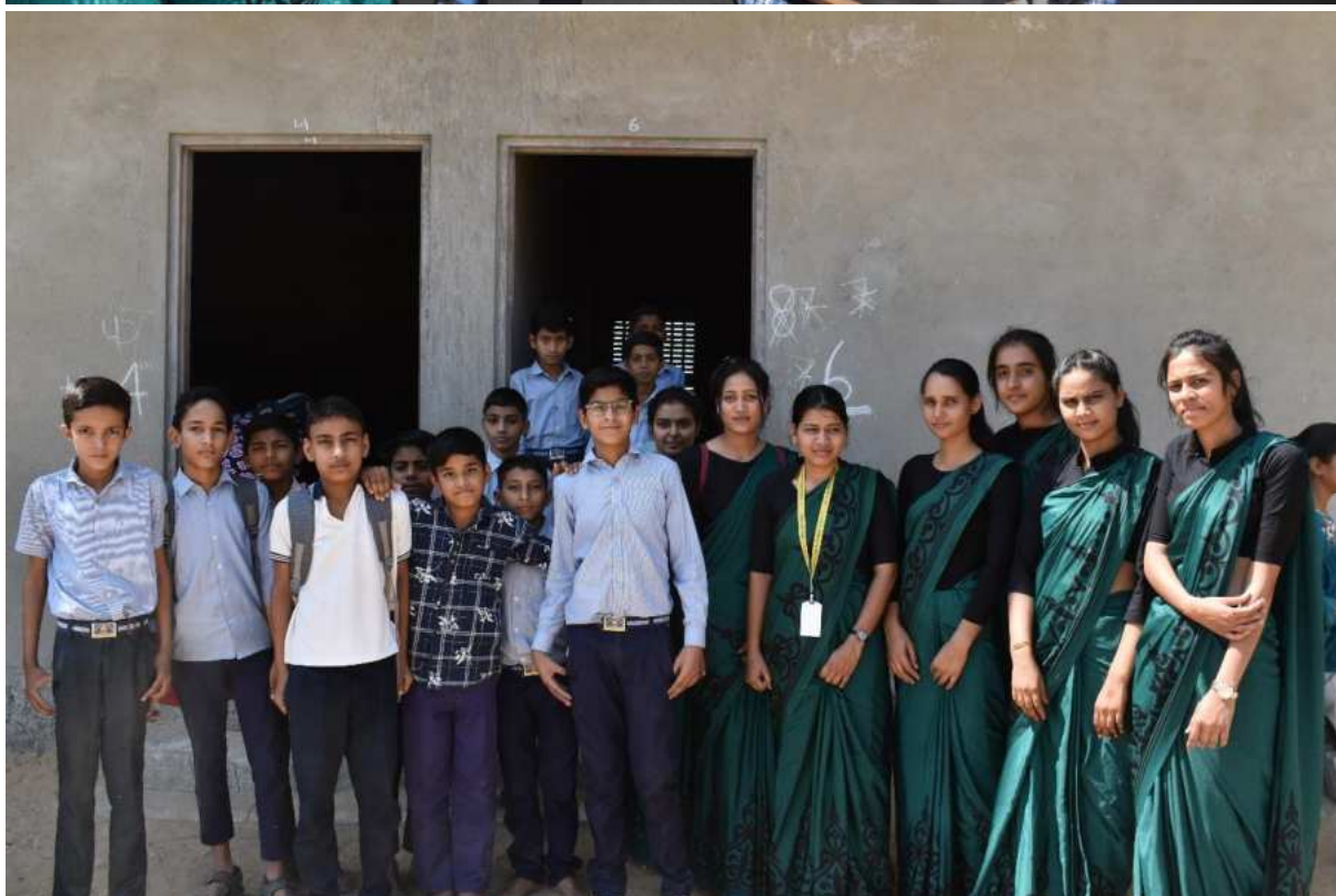
Teaching Learning Support to School Children