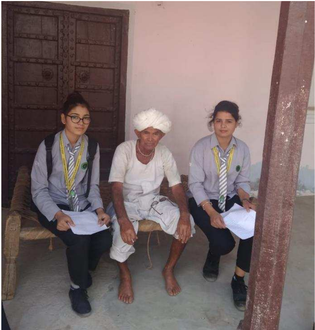
Education Mentorship – Household Survey