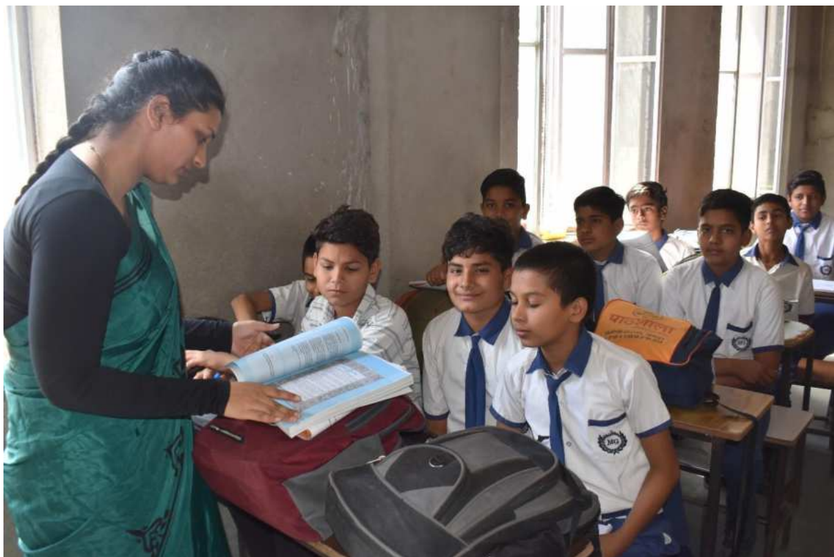
Teaching Learning Support to School Children