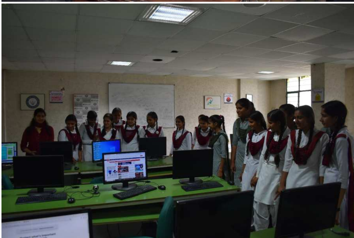
Career Counselling Session for Local Girls