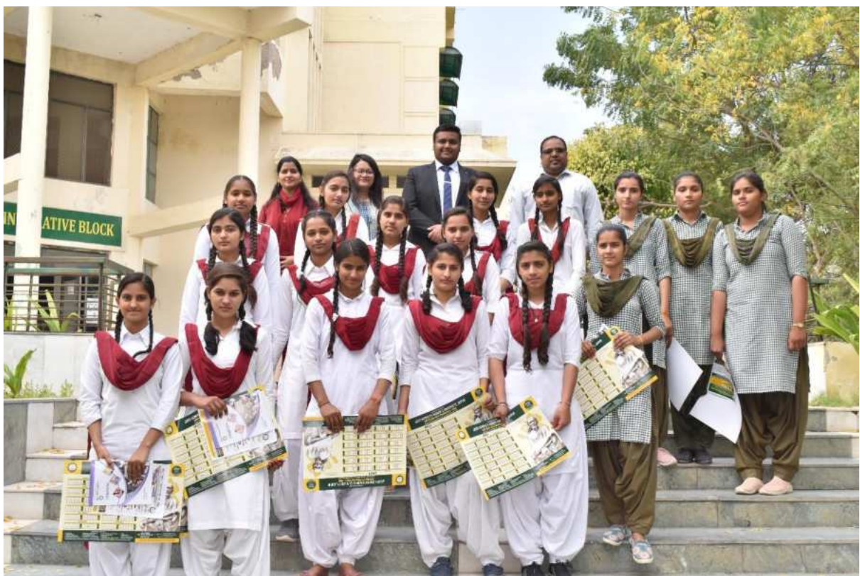
Career Counselling Session for Local Girls