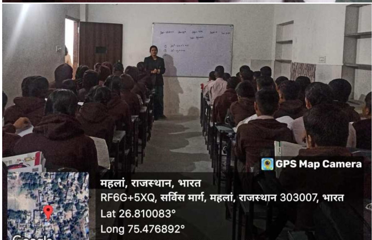
Teaching Learning Support to School Children