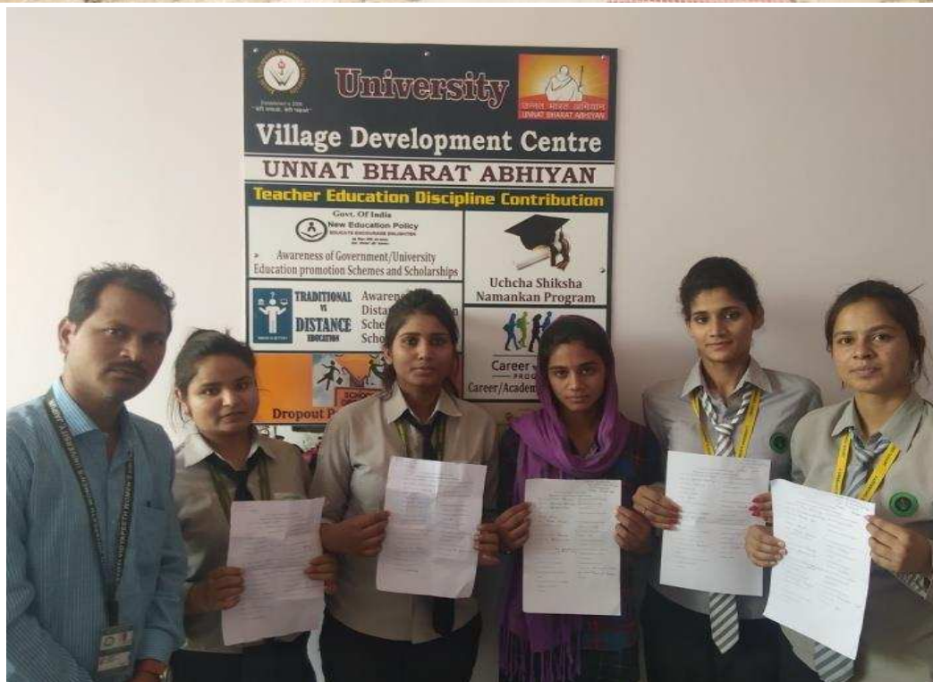
Village Development Centre for offering various educational opportunities to the local community