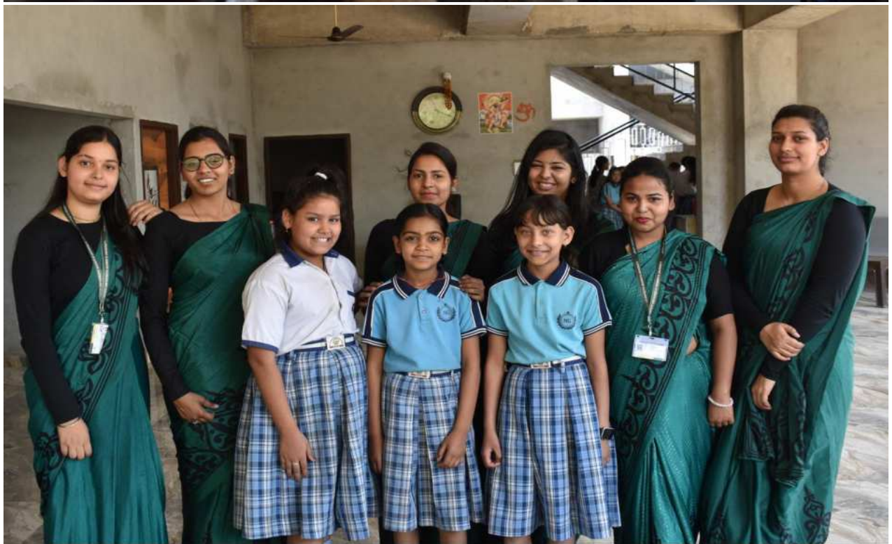
Teaching Learning Support to School Children