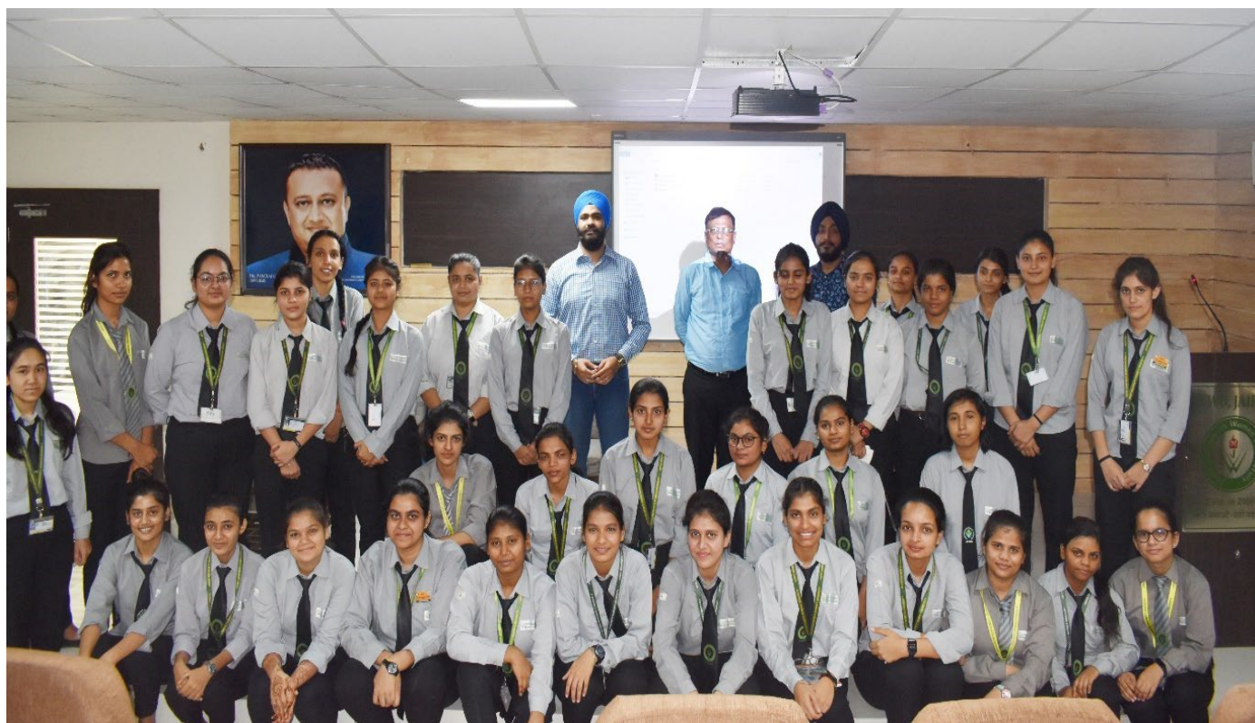
Workshop on Artificial Intelligence & Machine Learning in collaboration with Hexnbit

Established by Govt. of Rajasthan through Act No. 17 of 2008 under section 2(f) & (12b) of the UGC Act, 1956 NAAC Accredited | UGC Approved | Recognized by Statutory Councils