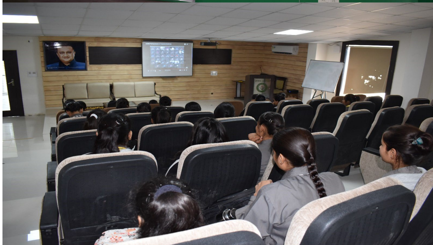
Faculty Development Programme (FDP)