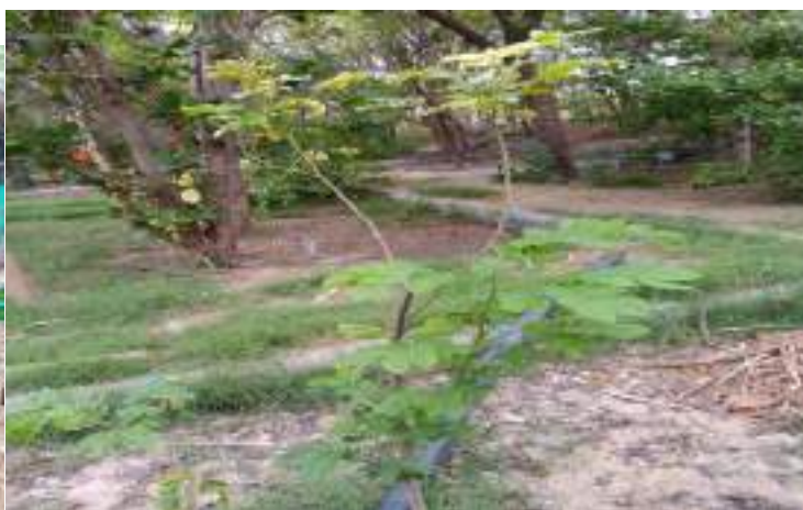
MORINGA OLIEFERA (SHAJNA )