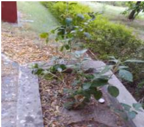
WITHANIA SOMNIFERA(ASHWAGANDHA )