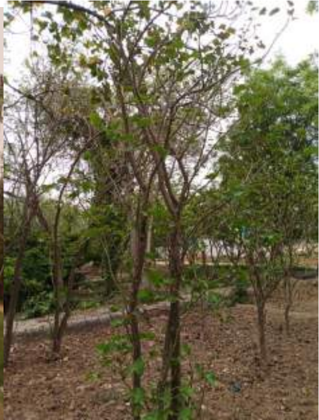
JATROPA CURCAS (RATANJOT)