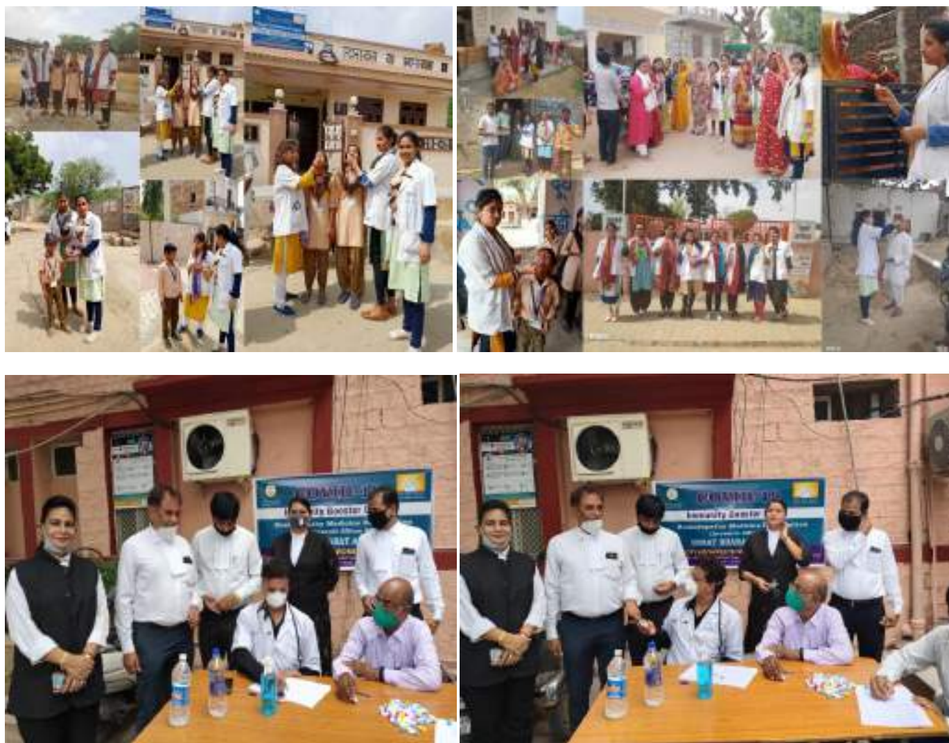
Figure 5 Distribution of Arsenic Album 30 in adopted villages & schools During COVID Pandemic