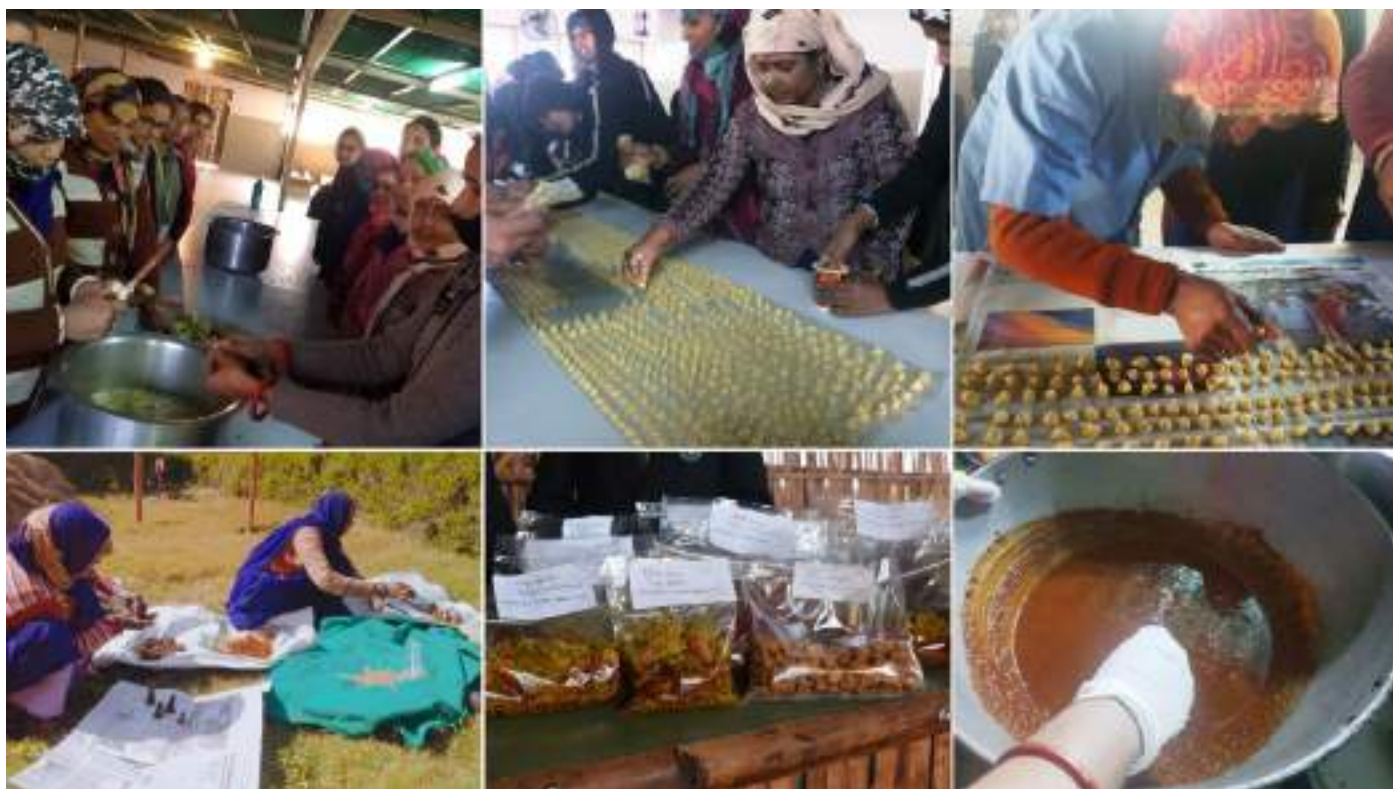
Figure 2 Villagers working under University Startup MahilaSamuhGramodhyog" & "Maa Rasoi"

5. Employment Generation: Implemented reservation policy in recruitment on all the posts since past 12 years.