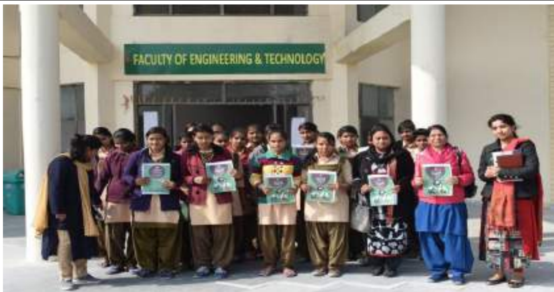
Figure 3 Career Counselling by University to prevent dropouts

7. Recognition of Local Identities: We emphasis on giving recognition to local identities of plants, food products, traditions, medicines etc. He strongly believes that geotagging of local identities should be done so that they could be identified and recognized by their place of origin. He has established “Local Research Resource Centre” to recognize Regional /Rural Technologies, Traditional Medicine & Therapies, Traditional customs & rituals for correlation & integration with ancient Indian literature and modern scientific techniques for Scholars and Academic tourists.