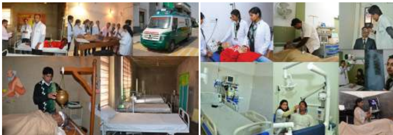
Figure 4 University Multispecialty AYUSH Hospital

15. Medical Services: University 100 Bedded AYUSH Hospital 'Suryansh Arogyashala' and other associated units of University is providing extension services in the field of Medical & Health Care in the surrounding villages and established Village Development Centers in adopted villages to cater the health issues of the villagers. University is having 6 Village Development Centres (VDCs), 8 Private Health Centres (PHCs) and Integrated Facility Centre (IFC) located at Village - Mahala. and acts as a referral hospital for its VDCs and PHCs.