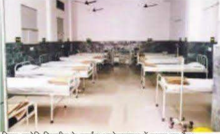
बिचून. ज्योति विद्यापीठ के सूर्याश आरोग्यशाला में लगाए गए बैड।