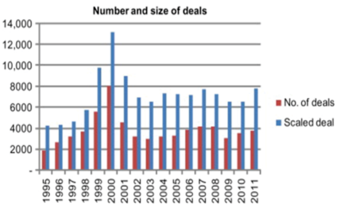
Figure-2- Pattern of Venture Capital over the years.