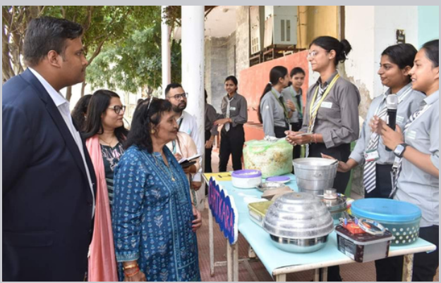
University Administration praised the initiatives of Department of Food & Biotech, highlighting how such events foster a sense of community while educating students about global food challenges. The event underscored the university's commitment to promoting health, nutrition, and sustainable Vidyapeeth Women's University successfully combined education, culture, and fun, making it an impactful experience for all involved.

The Department of Food & Biotechnology at Jayoti Vidyapeeth Women's University celebrated World Food Day with an exciting and educational event. The celebration saw active participation from students across various departments, who came together to install a range of food stalls featuring a diverse array of dishes. The food fair showcased stalls centered around themes such as Arts and Crafts, Fasting, Non-Fasting, and Nutritious Varieties of Food. Each stall creatively highlighted the importance of nutritious and sustainable food choices, aligning with the theme of World Food Day: "Healthy Diets for a Zero Hunger World." Students from different academic backgrounds contributed by preparing traditional, innovative, and healthy food options. The stalls offering fasting and non-fasting food items attracted particular attention, as they provided visitors with a variety of meals tailored to cultural and dietary preferences. The nutritious food stalls emphasized the significance of incorporating wholesome ingredients into daily diets, raising awareness about food security and healthy eating habits. The event was not only a celebration of food diversity but also a platform for students to demonstrate their creativity, knowledge, and entrepreneurial spirit. Attendees had the opportunity to enjoy delicious meals while learning food practices among its students. The World Food Day celebration at Jayoti about food sustainability and nutrition.